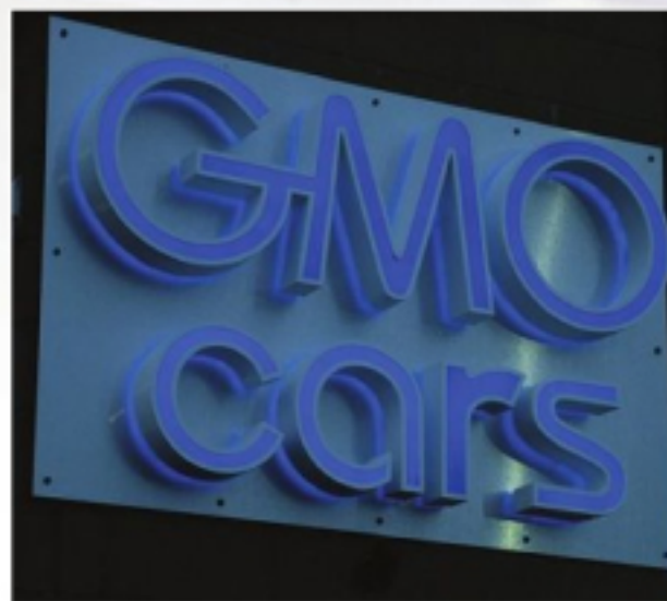
A large halo illuminated sign for a car showroom.