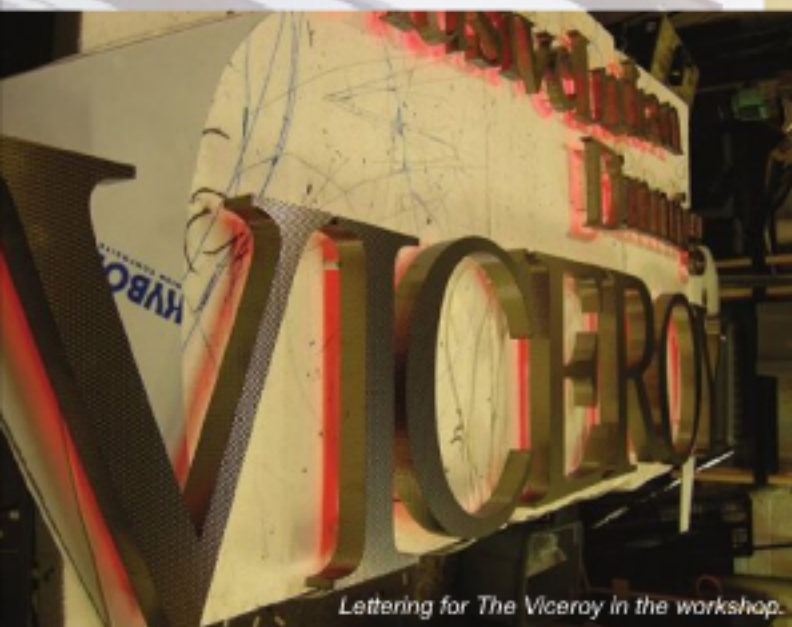
Lettering for The Viceroy in the workshop.

After relocating to Devon with his family, he set up 5StarSigns two years ago.