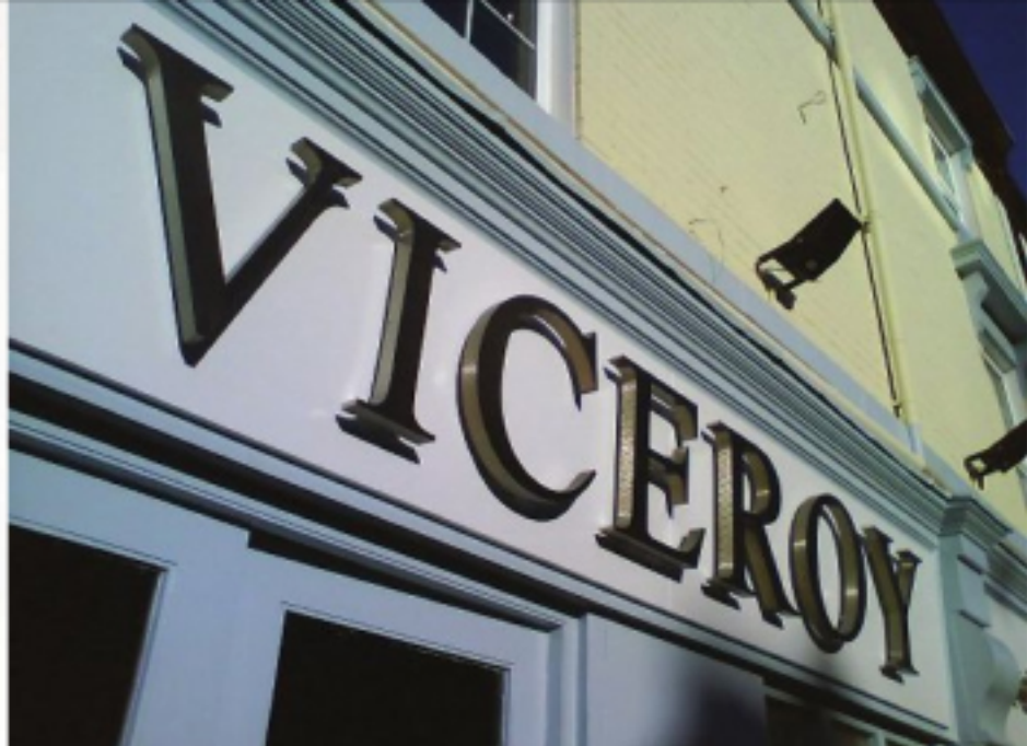
The finished sign installed above the exclusive restaurant in Derby.

Jarrard cites a curved sign, fabricated from stainless steel and cut to fit around turret, 8ft x 1.2m planter, as another good example of Jason's skills.