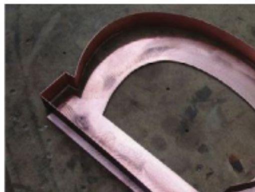
This series of photos show Jason building letters by hand.